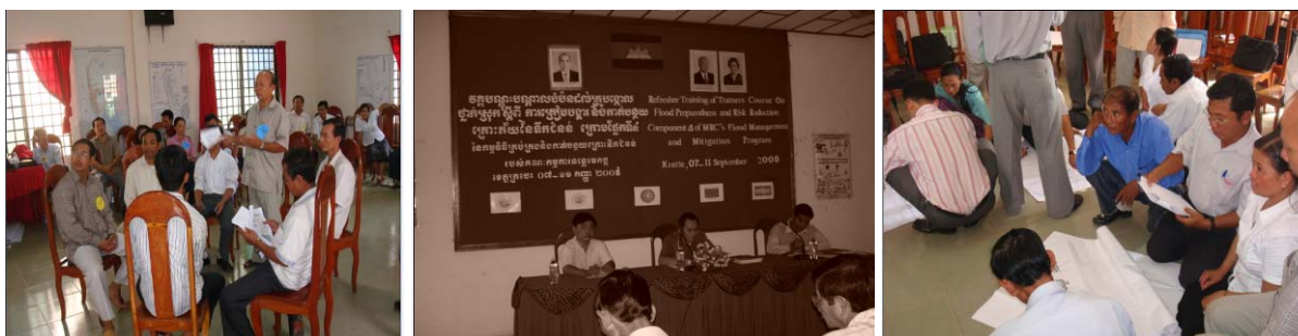
Photos of District Refresher ToT in Kratie

Activity 3.3: Support to conduct one Commune-level training on Flood Preparedness for the Commune DM Committees/Teams by the trained trainers in each of the selected districts in Kratie & Svay Rieng province, Cambodia