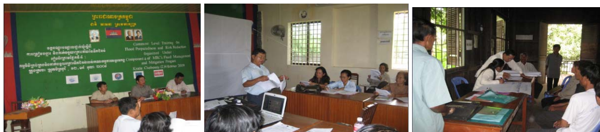
Photos of Commune Level Training in Kratie