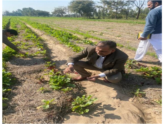
PNA team conducting baseline in Bhera