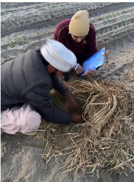
PNA team conducting baseline in Muzafferghar