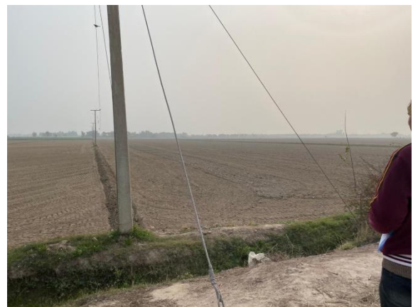
PNA team evaluating potential trial sites in Rahimyar Khan