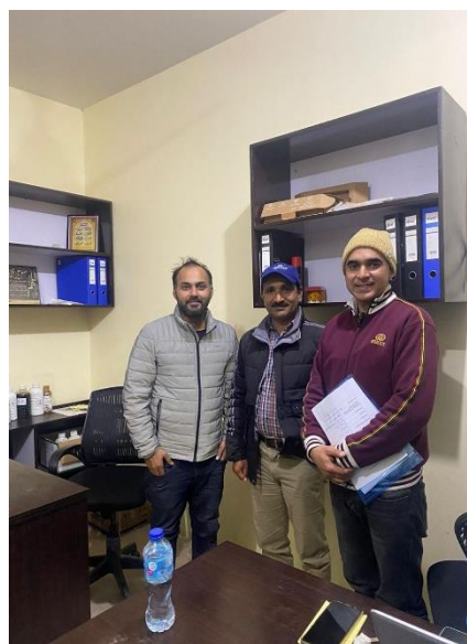
PNA team with technical team of partner farmer in Muzafferghar