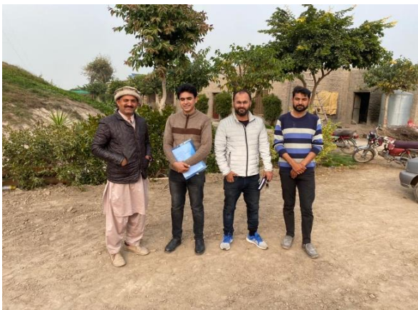
PNA team with technical team of partner farmer in Rahimyar Khan