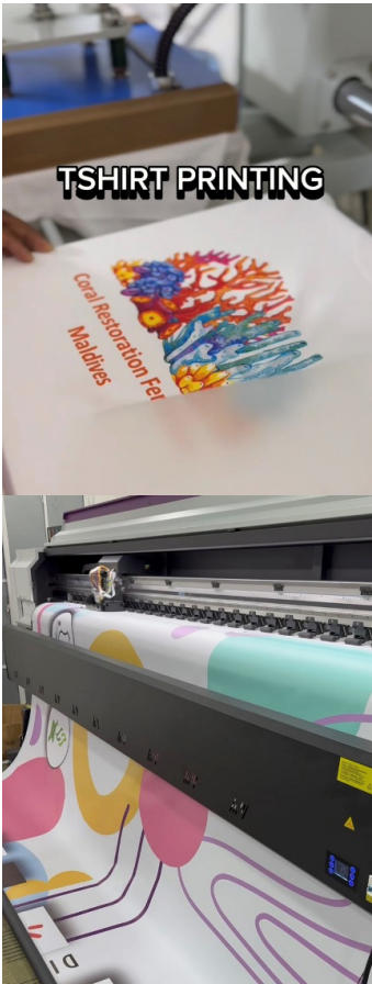
Main products offered by Inked Maldives

Like many businesses around the world, Inked Maldives faced unprecedented difficulties during the COVID-19 pandemic. "It was one of the toughest times we've seen," recalls the founder. With the studio closed for two months and no way to reach customers, the company had to relocate during the lockdown and continue paying staff salaries and rent.