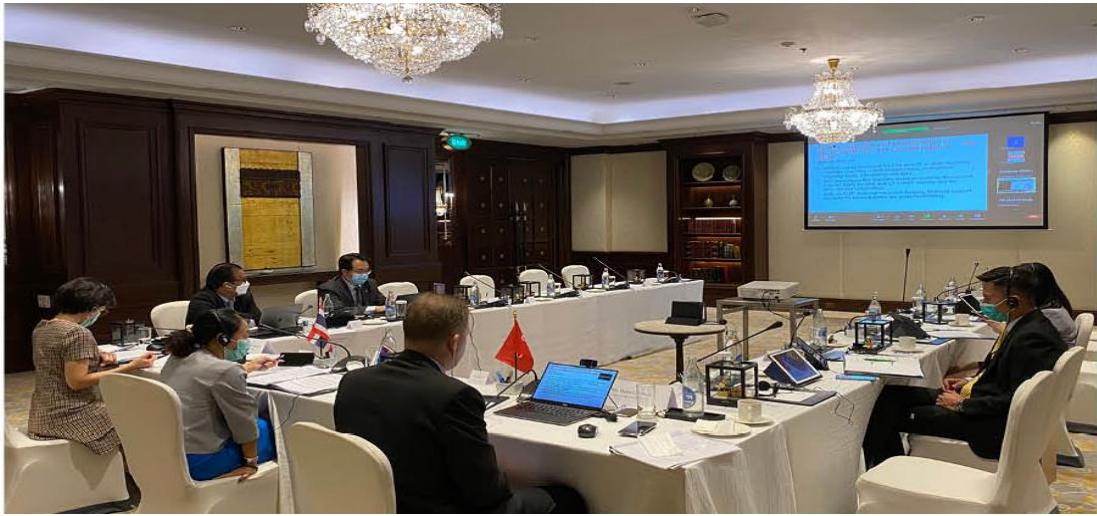
BOT members and representatives based in Thailand