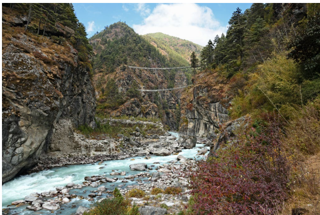
A double suspension bridge over the Dudh Koshi (a tributary of the Koshi river) on the way to Namche Bazar, Nepal

The development and management of water resources projects should focus on nature-based solutions and climate resilience.