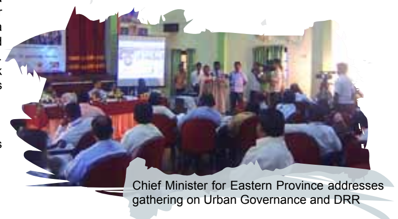
Chief Minister for Eastern Province addresses gathering on Urban Governance and DRR