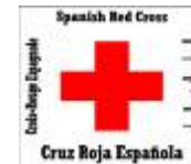
Spanish Red Cross