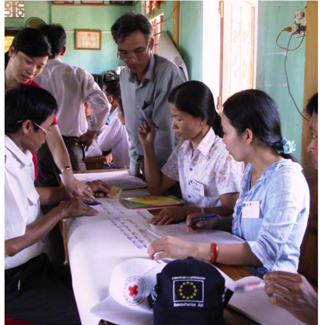
Risk assessment workshop for Red Cross volunteers, Vietnam

Presently, DIPECHO South East Asia is carrying out its 6 th Action Plan (July 2008 - January 2009). The expression of interest for the 7 th Action plan is due to be published towards the end of 2009.