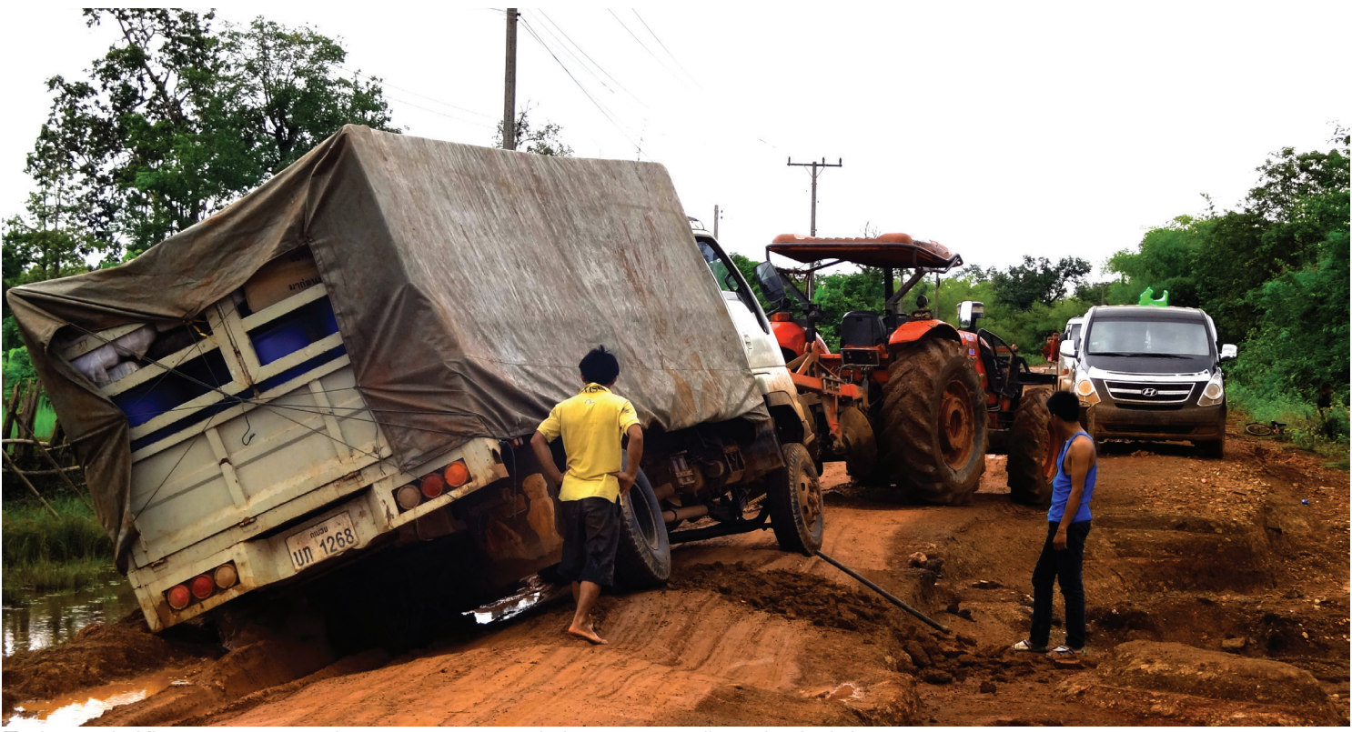
Typhoons in Khammouane province cause economic losses, as well as physical damage.