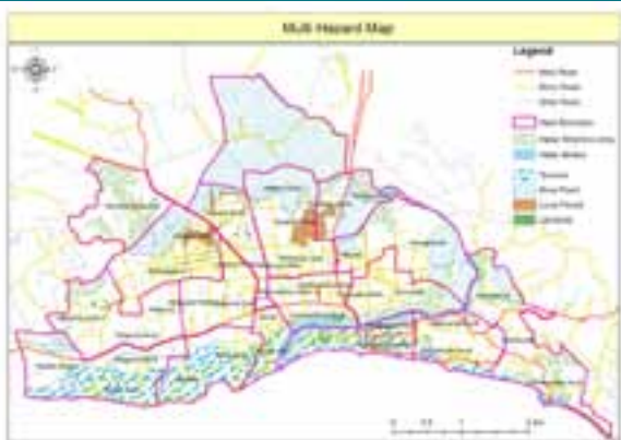
Figures 2 & 3