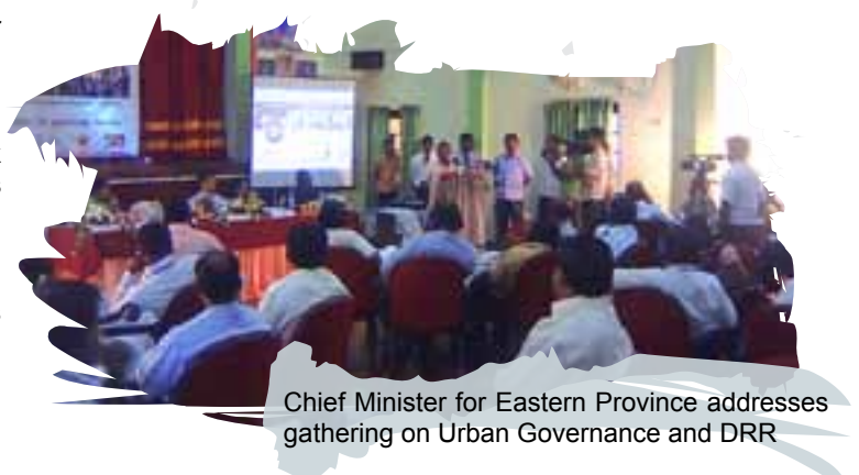
Chief Minister for Eastern Province addresses gathering on Urban Governance and DRR