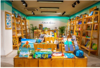
Authentic Maldives stores promote Maldivian craftsmanship

One of BCC's standout achievements is the Authentic Maldives 2 initiative, which has successfully connected over 300 local suppliers with new markets, showcasing more than 5,000 unique Maldivian products. This initiative not only boosts the local economy but also shines a spotlight on Maldivian craftsmanship across the globe.