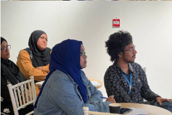
SMEs participated in a workshop on Business Resilience

BCC recognizes the importance of building resilience in the SME sector. While specific programs on business continuity planning or disaster preparedness are still under development, BCC is actively supporting SMEs through its training initiatives. “To navigate these challenges, SMEs often diversify their supply chains, establish collaborative networks with other businesses, and seek support from local authorities. Some businesses also adopt flexible business models that allow them to pivot quickly in response to disruptions. However, the extent of preparedness varies, with some SMEs being more proactive than others” emphasized the BCC representative.