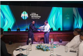
Workshop on Business Resilience for Maldivian SMEs

The Maldivian government plays a crucial role in nurturing SMEs by creating a favorable environment for entrepreneurship through policies, financial incentives, and ecosystem-building efforts. A key aspect of this support is the provision of policy direction and guidance by the Ministry of Economic Development and Trade in the MSME development initiatives implemented by BCC.