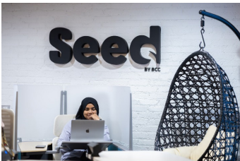
The SeedbyBCC co-working space

BCC is more than just a service provider - it is a space for innovation and collaboration. The SeedbyBCC co-working space offers budding entrepreneurs and startups an environment where ideas can flourish and grow. This initiative fosters networking, collaboration, and creative development among emerging businesses, acting as a springboard for innovation.