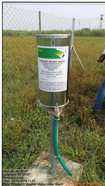
One of the automated rain-gauges installed in a pilot district