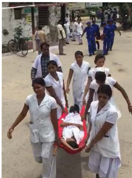
Preparing health care providers for emergencies