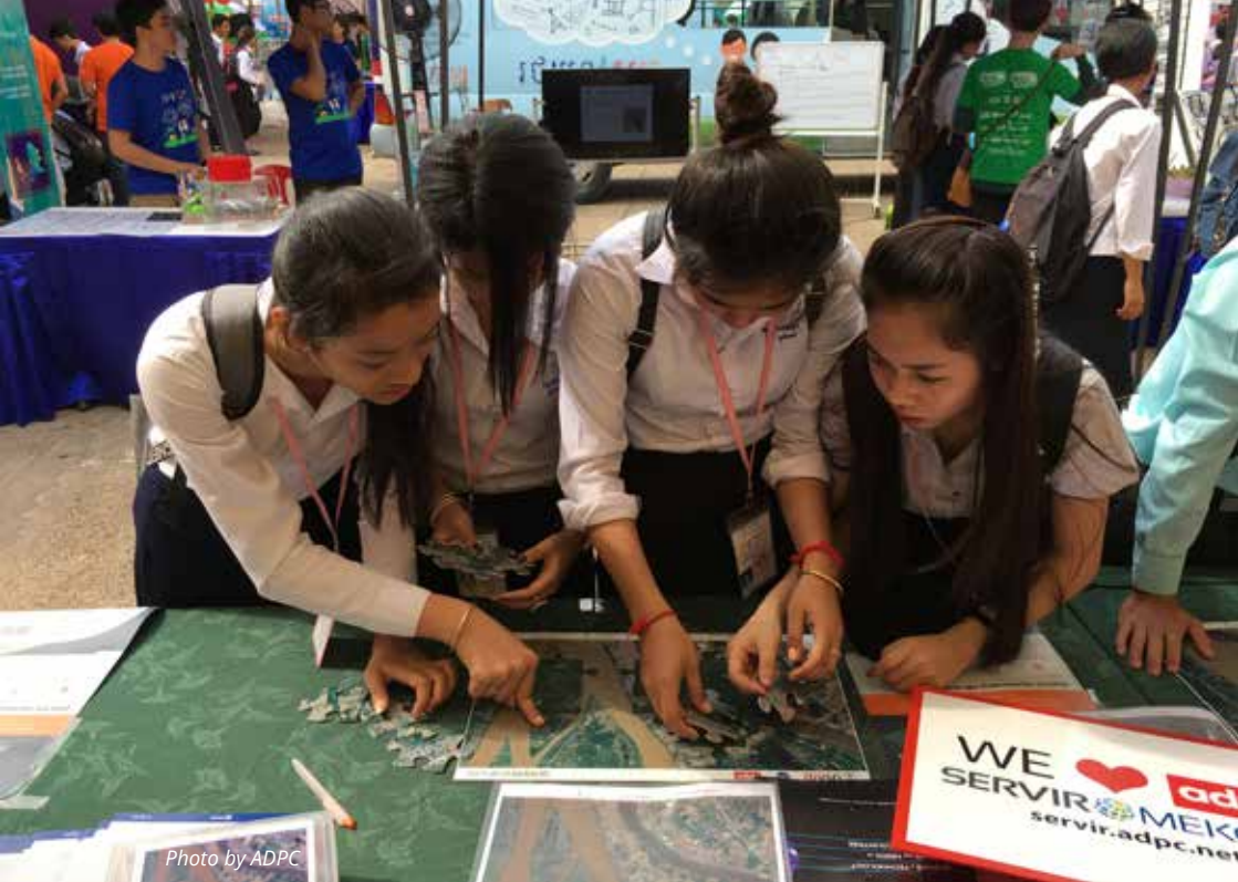
Students put together a puzzle to understand the importance of satellite technology as they gather at ADPC's booth for 2017 CSEF in Cambodia.

In another event, ADPC showcased the work of SERVIR Mekong at Thailand's National Science and Technology Fair. Students attracted to ADPC's interactive booth learned how to use geospatial technologies to identify different geographic features. The booth also featured a demonstration of Google Earth, where students could learn about mapping technologies by locating their towns, schools, and homes.