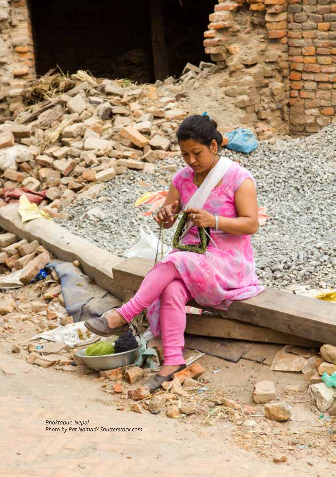
Bhaktapur, Nepal