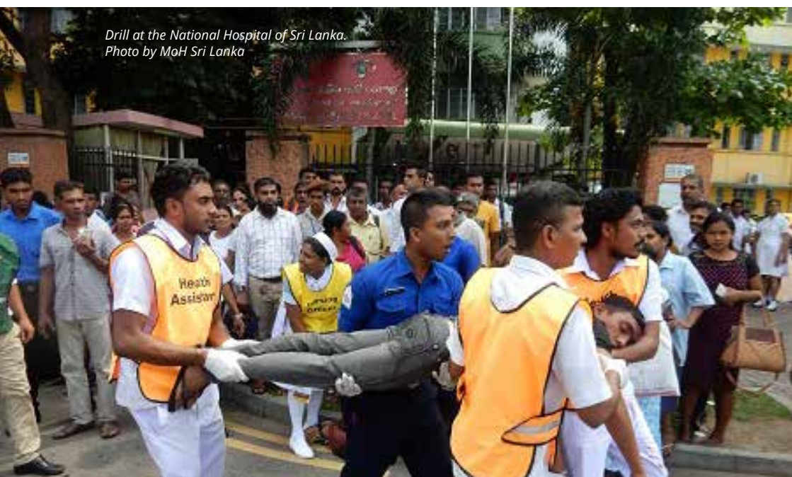
Drill at the National Hospital of Sri Lanka.

This program proved beneficial for the country, with approximately 20 hospitals receiving formally prepared and scientifically-based disaster management plans every year. Today, almost every hospital in Sri Lanka has participated in the program and developed their own disaster management plan. With diploma holders distributed all over the island, doctors no longer travel to distant hospitals during disasters or emergency situations. Diploma holders are also training other health workers at the local level to ensure the impact of the program continues to ripple throughout the country.