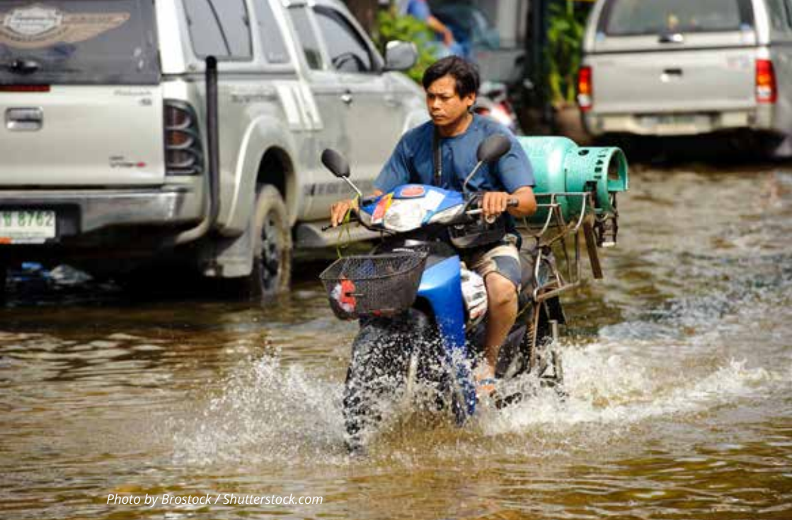
A delivery man drives a motorcycle on a flooded street during the 2011 flood in Thailand.