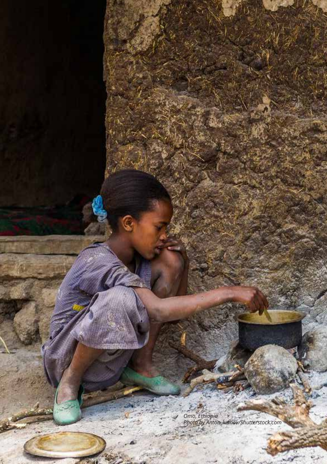
Omo, Ethiopia