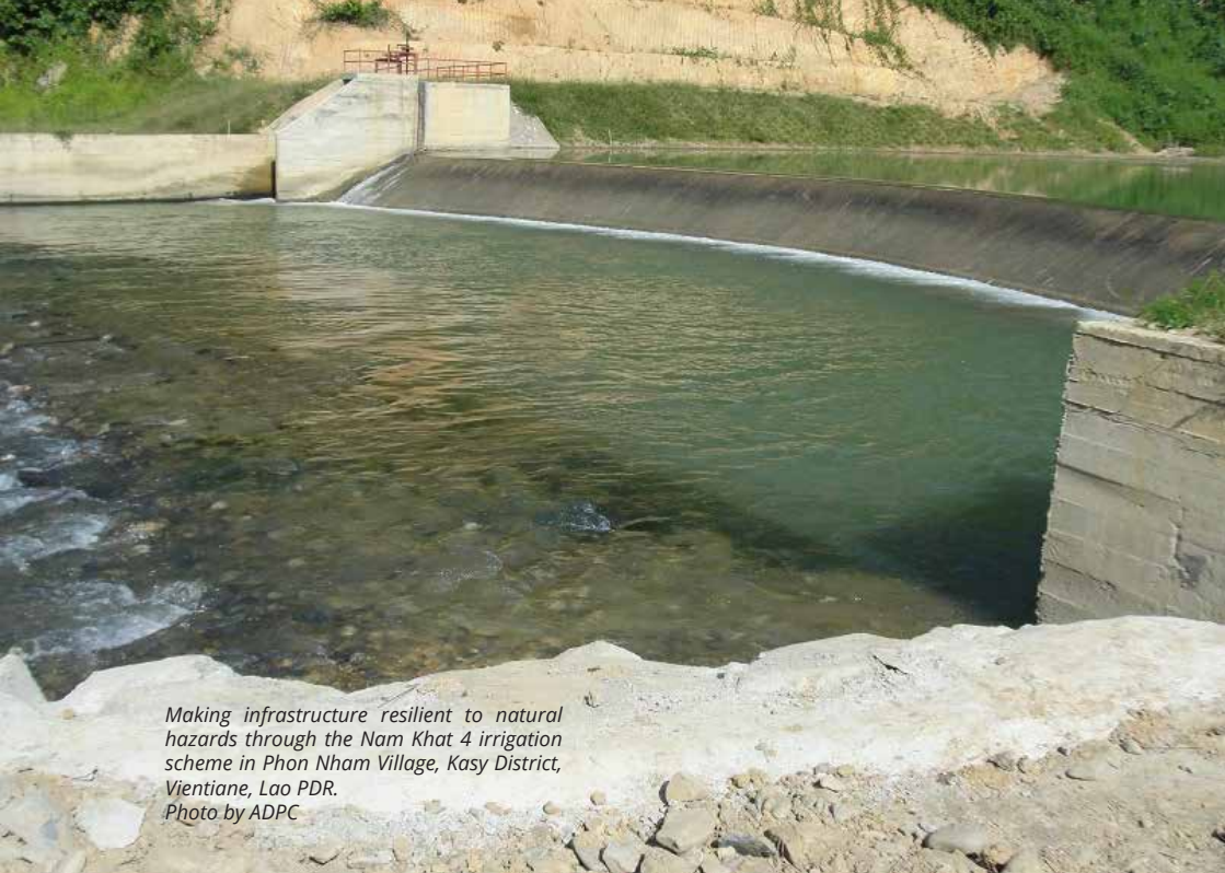
Making infrastructure resilient to natural hazards through the Nam Khat 4 irrigation scheme in Phon Nham Village, Kasy District, Vientiane, Lao PDR.

for critical national and provincial roads, including a dataset providing in-depth information about hazard levels and potential disaster impacts on vulnerable routes.