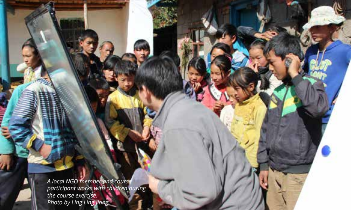
A local NGO member and course participant works with children during the course exercise.

This inclusive process was pivotal in urging relevant government agencies, schools and villages to actively integrate the whole community into disaster risk management activities – an important step in changing the community's mindset regarding disasters. In Xigou Village, a training workshop on disaster risk management was scheduled on a Saturday, so even children could participate.