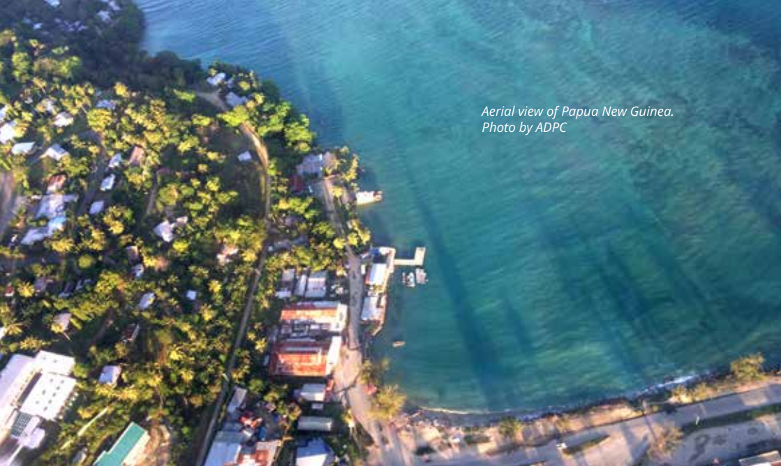
Aerial view of Papua New Guinea.