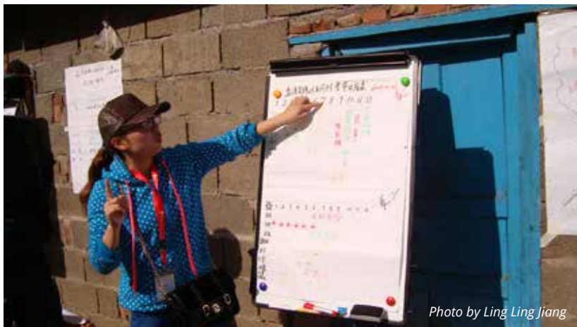
A school teacher, who is also a course participant, explains the group assignment during a course exercise.

Sichuan, China — China has suffered 151 earthquakes measuring from 6.5 to 7 on the Richter scale between 1964 and 2013. Unfortunately, earthquakes are not the only hazard that affects Sichuan Province. Dangers such as landslides, fires and floods put those in the area at risk, especially those living in the hazard prone mountain regions. The 160 million children living in rural areas are also vulnerable to these threats.