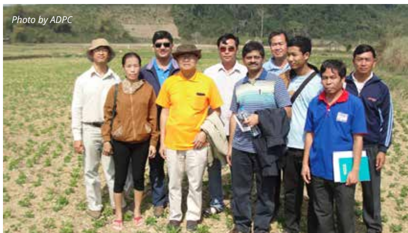
Project team visits site to build resilient irrigation scheme.

An example of ADPC's support was for Lao PDR's transportation sector. As landslides frequently burden the sector, there was a need to have reliable information about the level of landslide threat to road infrastructure and commuters. ADPC developed a landslide inventory framework