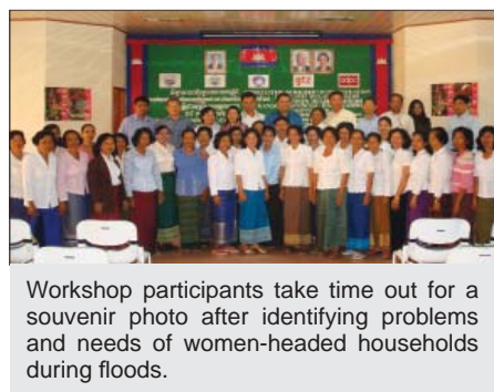
Workshop participants take time out for a souvenir photo after identifying problems and needs of women-headed households during floods.

In the second year of the Flood Emergency Management Strengthening (FEMS) project under the Component 4 of the Mekong River Commission's Flood Management and Mitigation Program (FMMP), the provincial and district Committees on Disaster Management (PCDM and DCDM) of the