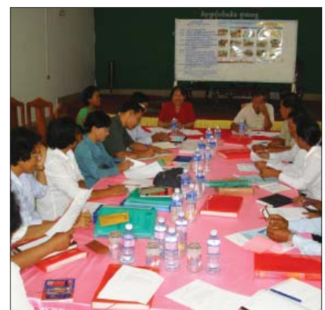
Officers of provincial and district office of the Department of Women Affairs and the NGO Positive Change for Cambodia (PCC) meet to formulate plans and activities addressing the needs of women-headed households.

In late September 2007, PCC organized four district level consultative meetings with the provincial and district Departments of Women’s Affairs. The objectives of these meetings were multi-fold, to present the women-headed household problems identified so far for the inclusion in the brochure, to look at the potential access to local financial services to be presented for incorporation in the CDP process and also to orient the personnel from Women’s Affairs departments on the preparation of proposals to seek additional external resources for the implementation of more gender-sensitive activities. The meetings endorsed the production of brochure and realizing the need to consult the key beneficiaries of WHH on the activity, the meetings recommended to undertake a short field mission. The missions took place in the seven selected villages in Sithor Kandal and Peam Chor districts of Prey Veng province. Though the coverage was limited to Prey Veng province, the Kandal provincial Department of Women’s Affairs also actively took part in the mission. The final draft of the brochure was prepared at the end of the mission, making use of not just the mission findings but also based on the outcomes of the WHH related events.