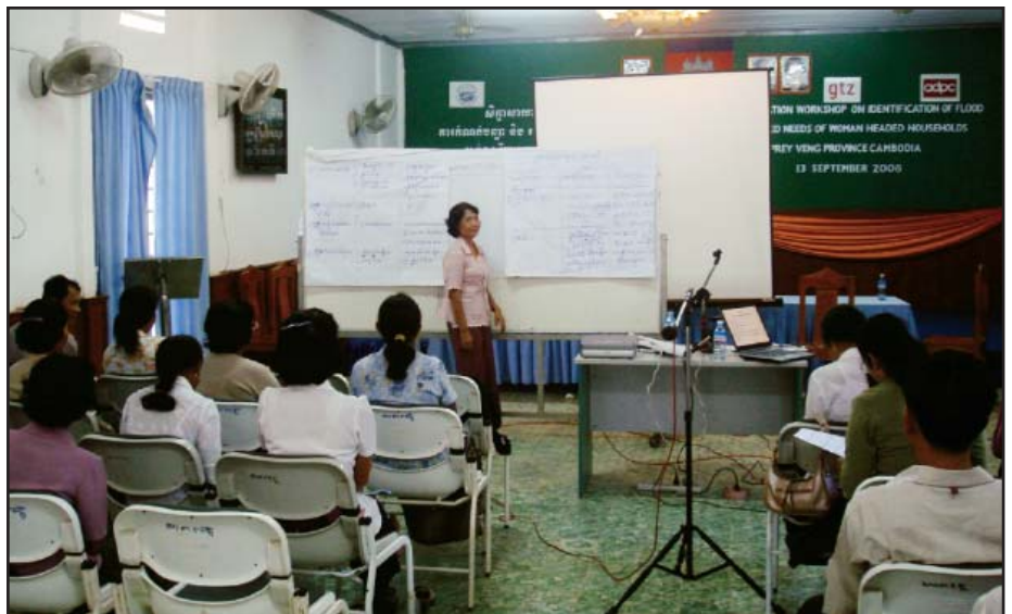
Consultation Workshop in identification of flood related needs of women headed households in Prey Veng province