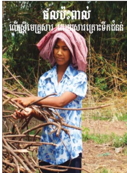
The ADPC brochure containing information on needs of women-headed households in time of floods.

Cambodia, gender mainstreaming has gained momentum but it is not being fully integrated into disaster management sector. Many ministries, active in disaster management, have not developed gender-mainstreaming strategies