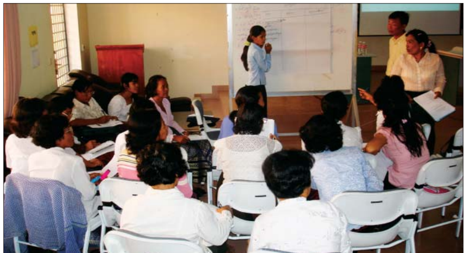
A workshop facilitator leads the group discussions on possible interventions at the commune level to address the needs of women-headed households during floods.